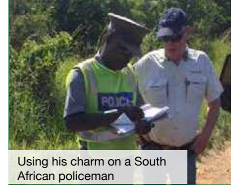
Using his charm on a South African policeman