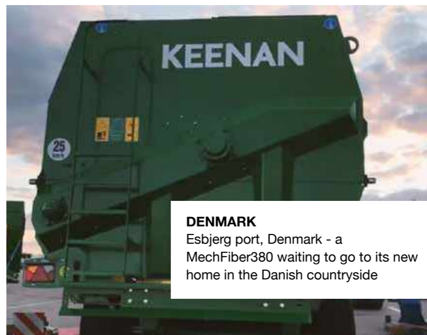
DENMARK Esbjerg port, Denmark - a MechFiber380 waiting to go to its new home in the Danish countryside