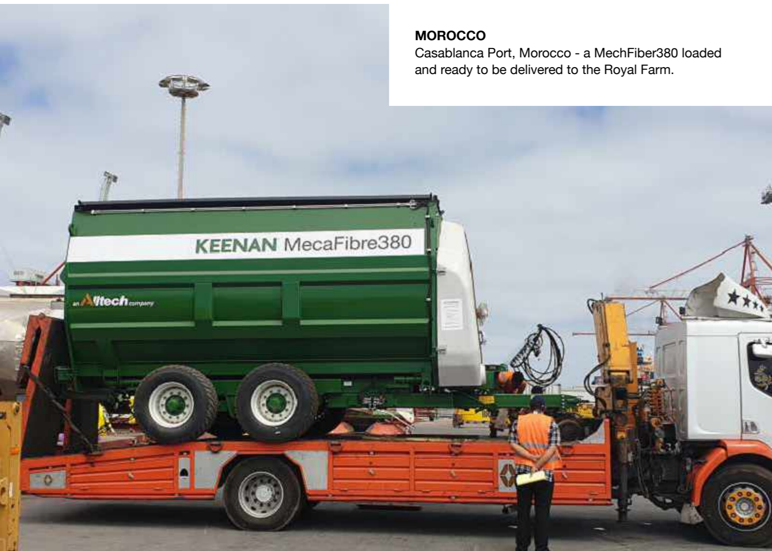
MOROCCO Casablanca Port, Morocco - a MechFiber380 loaded and ready to be delivered to the Royal Farm.

With 20,000 head of cattle, this beef farm in Papua New Guinea has added another KEENAN to their fleet. Each diet feeder mixes 10 loads per day in a tough working environment.