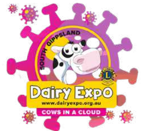
AUSTRALIA KEENAN Australia were gold sponsors of the South Gippsland virtual Dairy Expo 7-21 Sept