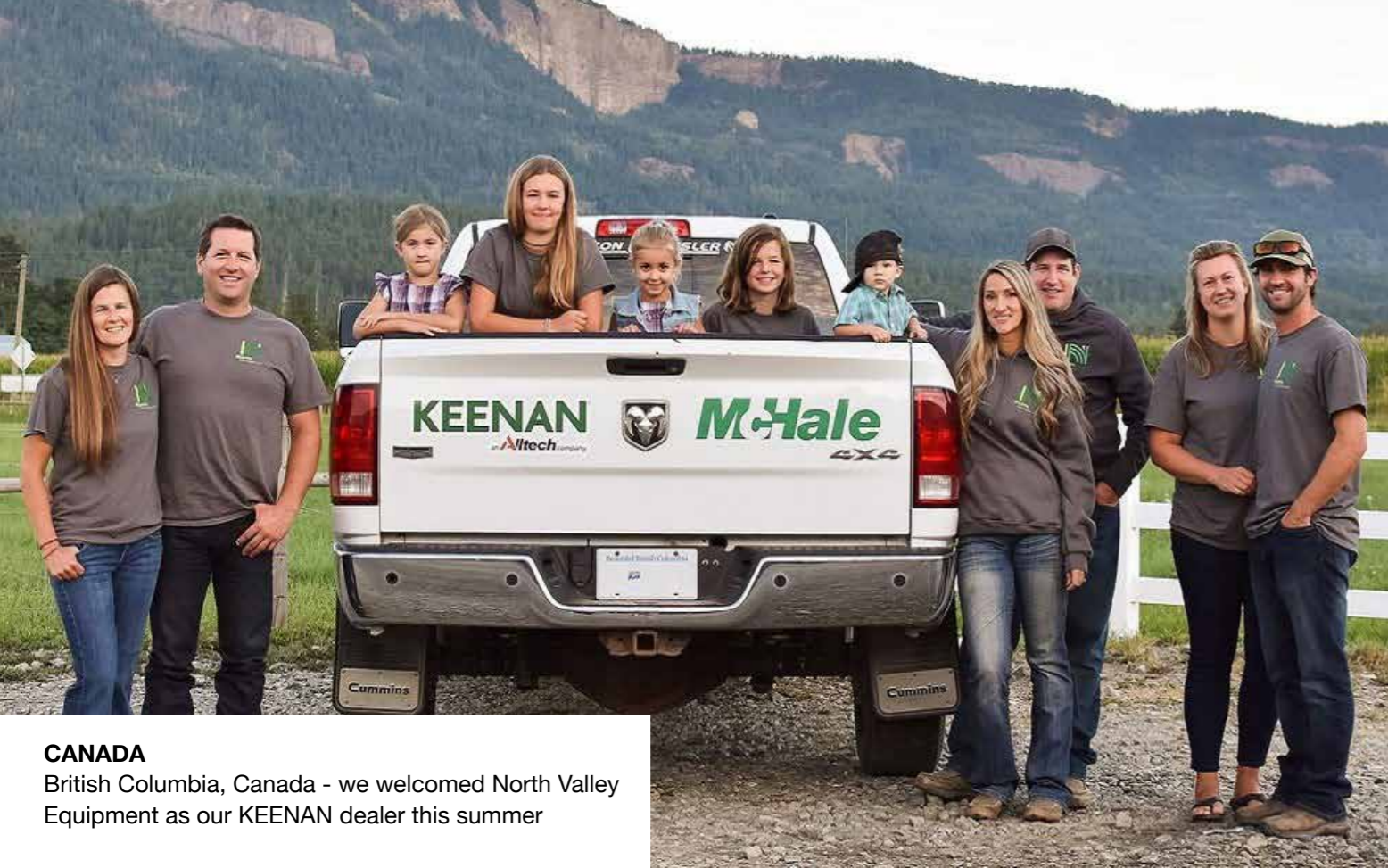
CANADA British Columbia, Canada - we welcomed North Valley Equipment as our KEENAN dealer this summer