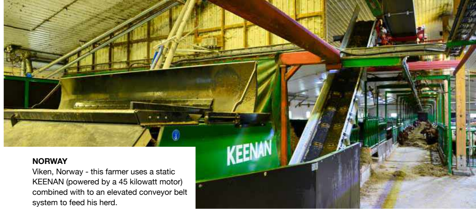
NORWAY Viken, Norway - this farmer uses a static KEENAN (powered by a 45 kilowatt motor) combined with to an elevated conveyor belt system to feed his herd.