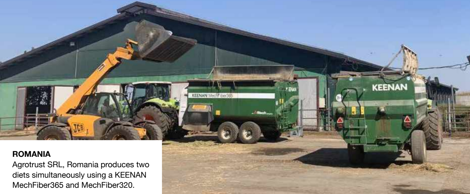
ROMANIA Agrotrust SRL, Romania produces two diets simultaneously using a KEENAN MechFiber365 and MechFiber320.