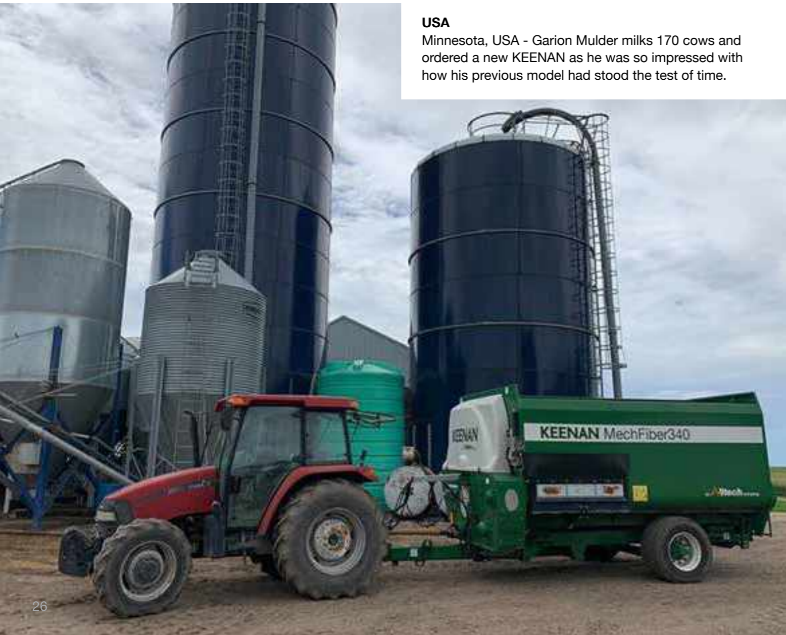
USA Minnesota, USA - Garion Mulder milks 170 cows and ordered a new KEENAN as he was so impressed with how his previous model had stood the test of time.