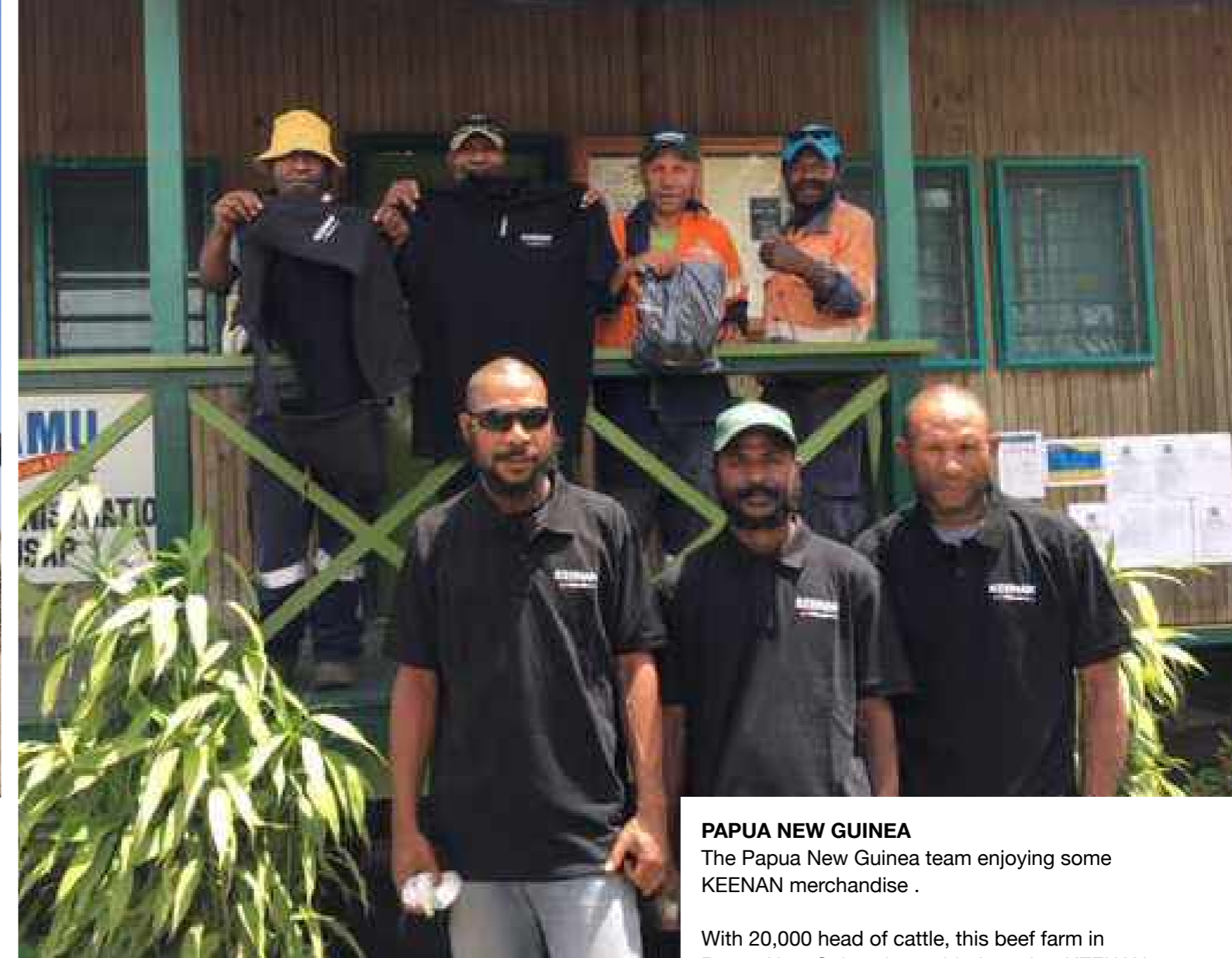
PAPUA NEW GUINEA The Papua New Guinea team enjoying some KEENAN merchandise .

With 20,000 head of cattle, this beef farm in Papua New Guinea has added another KEENAN to their fleet. Each diet feeder mixes 10 loads per day in a tough working environment.