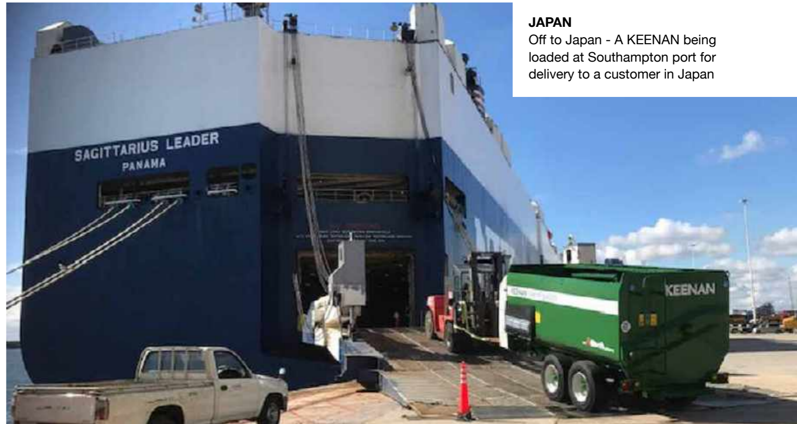
JAPAN Off to Japan - A KEENAN being loaded at Southampton port for delivery to a customer in Japan